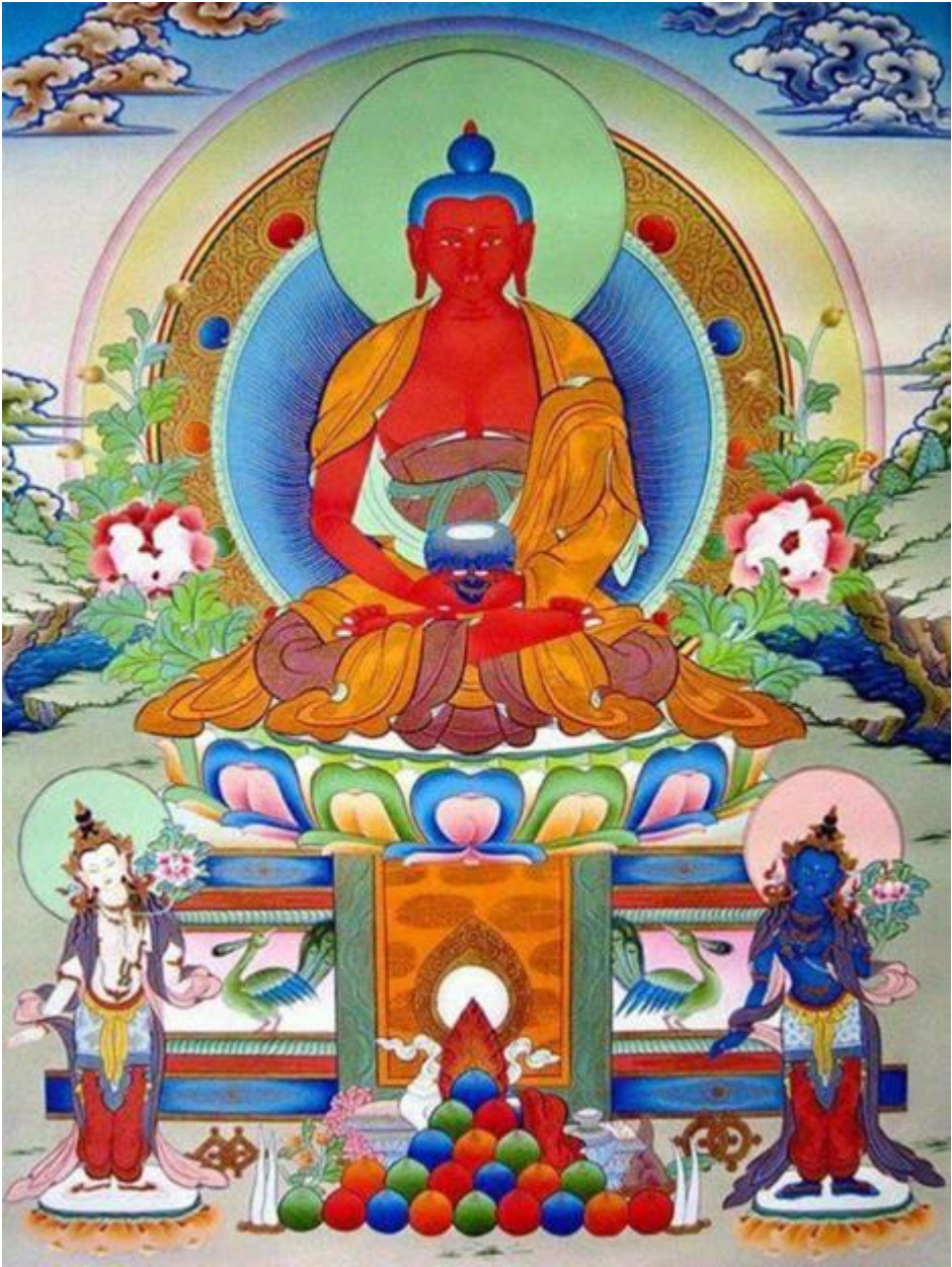
Figure 1: Buddha Amitabha